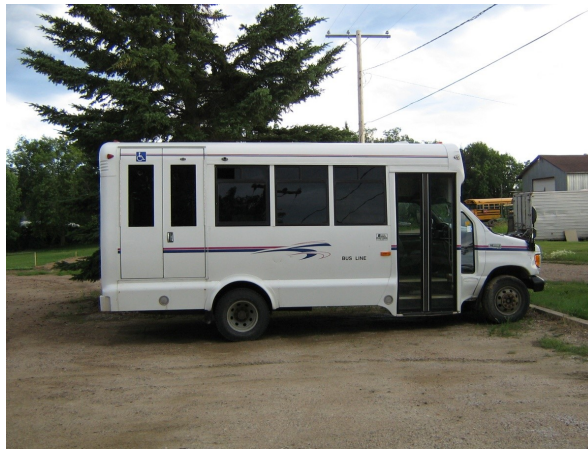
1998 Ford Econoline E-450 Super Duty Handi-Van

Engine: Ford/International 7.3 diesel engine