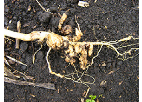
Clubroot infected canola root with intact clubroot galls

Clubroot is a soil-borne disease caused by a microbe, Plasmodiophora brassicae ( P. brassicae ). Clubroot affects the roots of host plants, which include cruciferous field crops such as canola, mustard, camelina, oilseed radish and taramira, and cruciferous vegetables such as arugula, broccoli, Brussels sprouts, cabbage, cauliflower, Chinese cabbage, kale, kohlrabi, radish, rutabaga and turnip. Cruciferous weeds (e.g. stinkweed, shepherd's purse, wild mustard) can also serve as hosts for the clubroot pathogen.