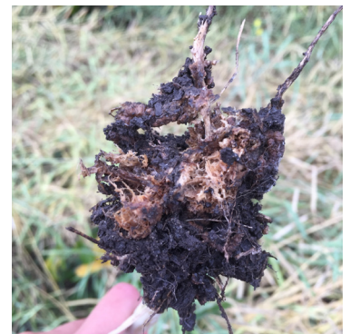
Decomposing clubroot gall

Infected roots will eventually disintegrate, releasing resting spores into the soil, which may then be transported by wind, water erosion, animals/manure, shoes/clothing, vehicles/tires, or earth tag on agricultural or industrial field equipment. The clubroot pathogen, in the form of resting spores in the soil, can be moved any way that soil can be moved. Activities that move large volumes of soil (such as on agricultural or industrial field equipment) between areas or regions are considered to have the highest risk.